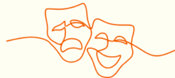
your sense of humor and the spirit of adventure

Toss out those extra clothes, because less is more! You never know, you might end up needing less than you think.