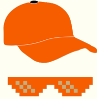
Cap and Sunglasses