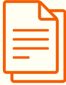
Soft copy of your Aadhar card