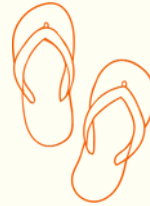
Flip-flops for lazing around the campsite