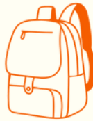
Small backpack to carry your essentials during the trek